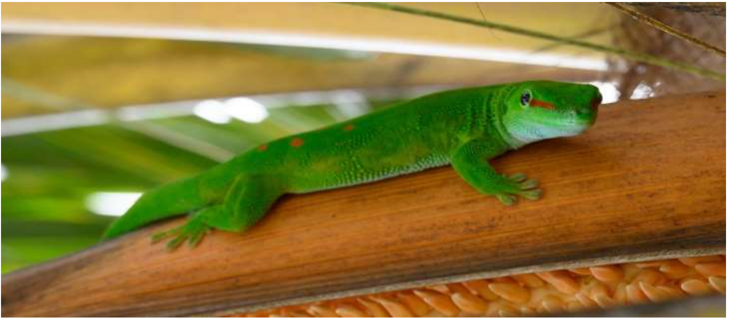
Next monthly photoshoot in Mauritius? If only.