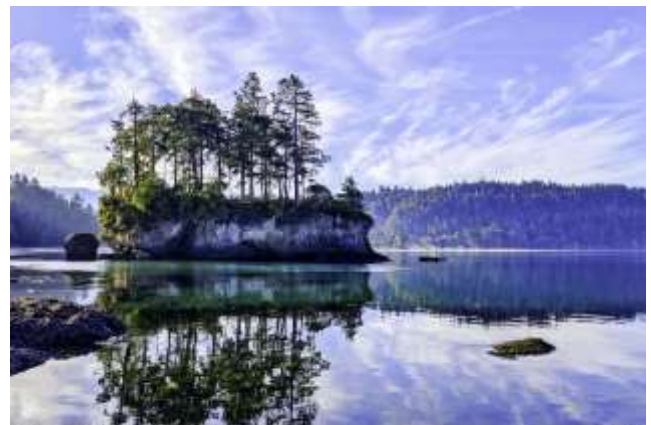
Northern Coast Washington State

Heading south once more, we checked out a snowy Mt Rainier then spent several days in Oregon. Portland was coloured by autumnal street trees, Halloween displays and pumpkins. We stayed with a friend of Julie's who took us on a tour of the state, starting with the Columbia River valley including waterfalls, then down the very picturesque coast, inland for covered bridges, and along the McKenzie River Hwy for coloured vegetation and snowy peaks (the road closed the next day). We spent our last week travelling down the Californian coast to