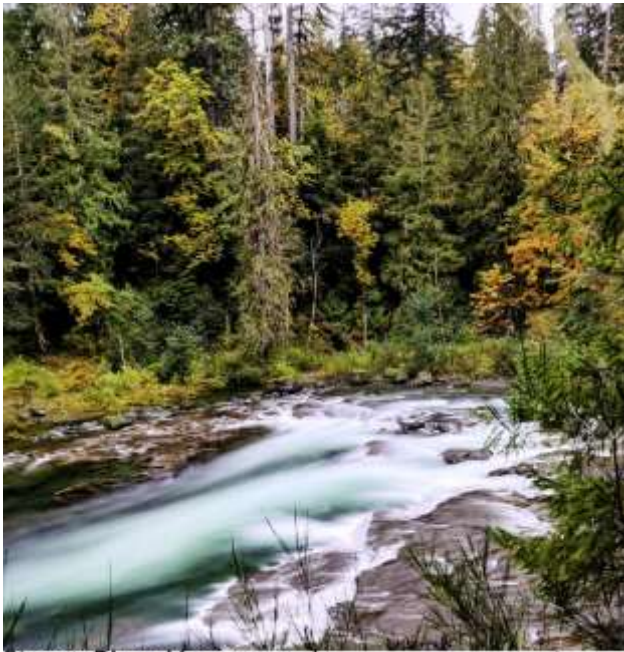
Stamp River Vancouver Is