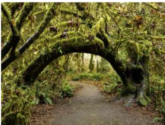
Hoh Forest Washington State

I couldn't get an eSIM for my phone, so I had to purchase SIM cards (check to get the right one) and coverage was variable. I purchased a eSIM for my new iPad but couldn't get it to work. Facebook Messenger was very handy for making phone calls. We booked many camp sites on the National Parks websites but occasionally couldn't but got a place by calling them. The Parks Canada website was useless for booking the bus to Lake Louise so we had to call. We booked three sites on hipcamp.com but only used one- the others being disappointing, and we wouldn't use it again. The RV sites were generally good. We looked for ones on rivers or lakes. San Francisco was a car park and the most expensive. Some places required coins for the laundry, quarters usually but in Canada some wanted $1 or $2 which weren't easily obtained at the last minute. Occasionally the showers were coin operated.