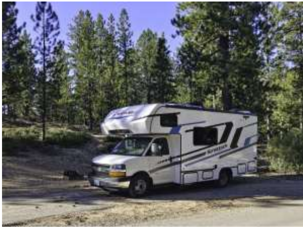
Holly Homey Phone

was no daily packing and unpacking. It was quite comfortable with a shower and toilet. The fridge and stove were both a good size. Four adults fitted relatively easily.