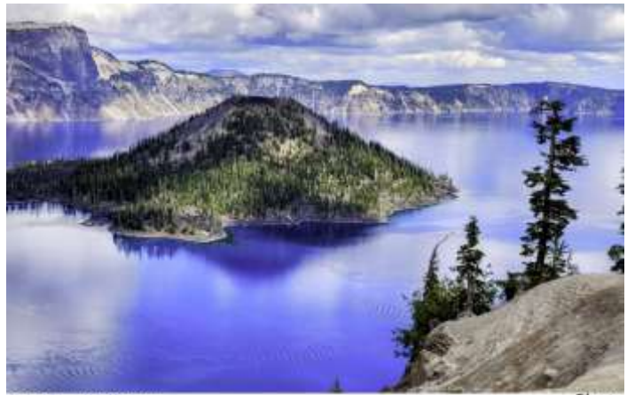
Crater Lake Oregon

We left the Sierra Nevada's for Crater Lake Oregon, an extraordinary place that is so serene and gloriously blue. We continued to Canada and the Rockies to see turquoise lakes, rivers, waterfalls and pine covered mountains, contrasting with the golden leaves of autumn. Everyplace had something beautiful to see - snowy mountains, scenic drives, dreamy valleys, sheer rock faces and glaciers. It was a landscape photographer's paradise. The most notable places in Canada were the Bow River and Johnson Canyon Falls Walk, Emerald Lake, Athabasca Glacier, the Icefields Parkway and Peytoe, Louise and Moraine Lakes. We had hoped to see some northern lights, but the weather was against us.