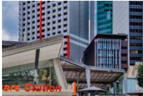
King George Square Bus station