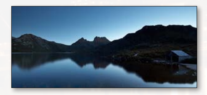
I couldn't have taken this photo without a wired remote, allowing me to use bulb mode.

A wired remote. For a few reasons. Even pushing the button on your shutter can create additional unwanted movement. Even if you use the 2-second timer, it can still take a little bit of time for your camera to effectively "settle" from the vibration. Also, make sure it's a remote that you can lock the shutter button, allowing you to make use of your cameras "bulb" mode. This will expand your creativity by being able to shoot images longer than 30 seconds for things like star trails etc, plus the added benefit of being able to shoot earlier before sunrise, and later after sunset.