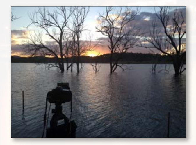
You shouldn't be afraid to put your tripod into nasty environments, like water. Just remember to clean it afterwards

the cheap and nasty head. The amount of time I had wasted trying to get things level, only to have to fix it in Photoshop later anyway was very frustrating. I then upgraded to a Manfrotto (055) with a simple ballhead. It cost me around $350 total, but it was fantastic. It's been in sea water, snow, mud, creeks and never missed a beat. I've since upgraded again (for weight reasons), so you can probably see where I'm heading with this. Buy a good tripod from the start & it will last you years, and make your life a whole lot easier.