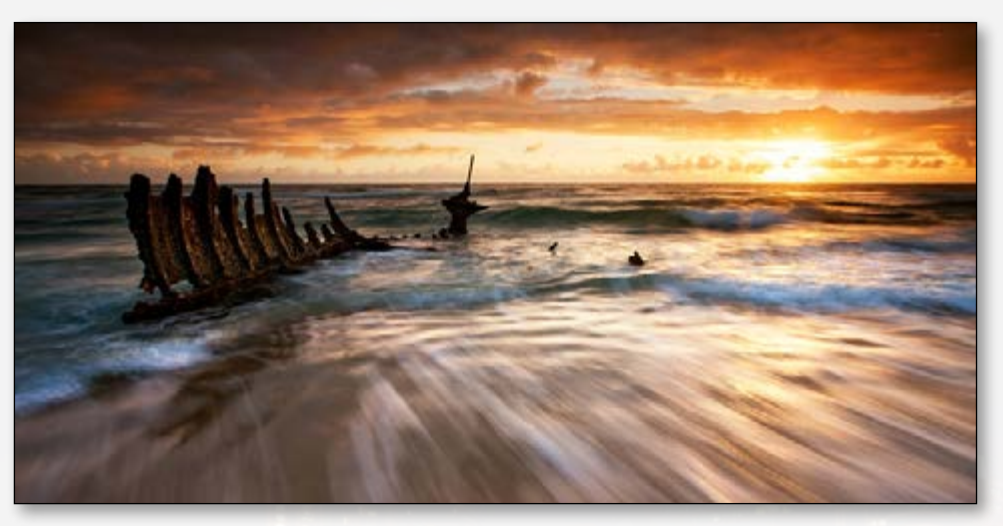
I had to bracket this image to get all the areas exposed the way I needed them to be.

So some of these things may seem a little picky, or 'extreme' but they may also make the difference between being able to print something 16" wide for photoclub, and printing 30"+ to hang on your wall at home, and although shooting for photoclub might be in the back of your mind, it's the shots to hang on the wall that I'm aiming for.