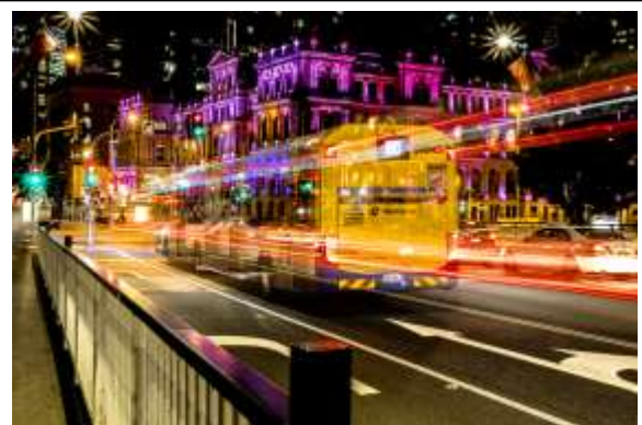
Casino through a moving bus by Swarna Wijesekera received an acceptance in Salon of Excellence 2020