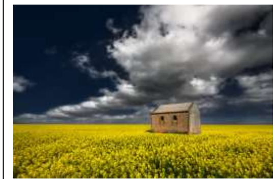
Canola under a southern sky by Ian Sweetnam received an acceptance in Salon of Excellence 2020

Salon of Excellence is hosted by different clubs each year under the banner of Photographic Society of QLD (PSQ) . This is open only to QLD clubs and is a low cost to enter so it is a good one to start entering competitions. This is an individual comp with an award for the club with the highest score from their members. It is a Print and Digital competition with six set subjects with A -Grade and Non A -Grade sections.