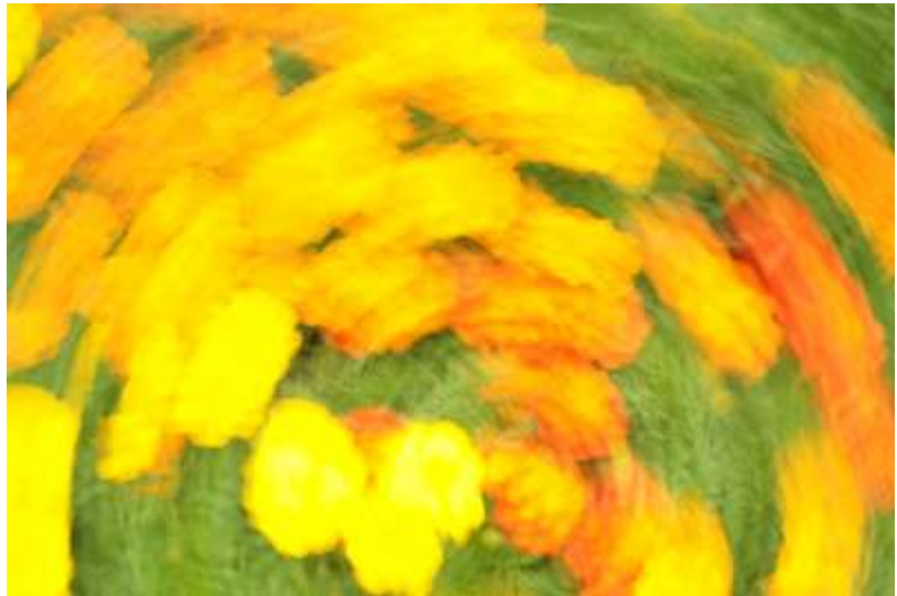
Colourful: Rodney Topor