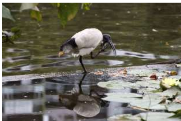
Bird: Hazel Sempf