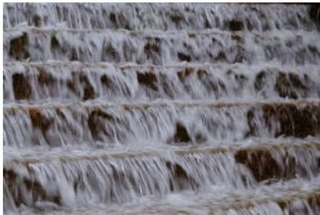
Waterfall: Suzanne Edgeworth