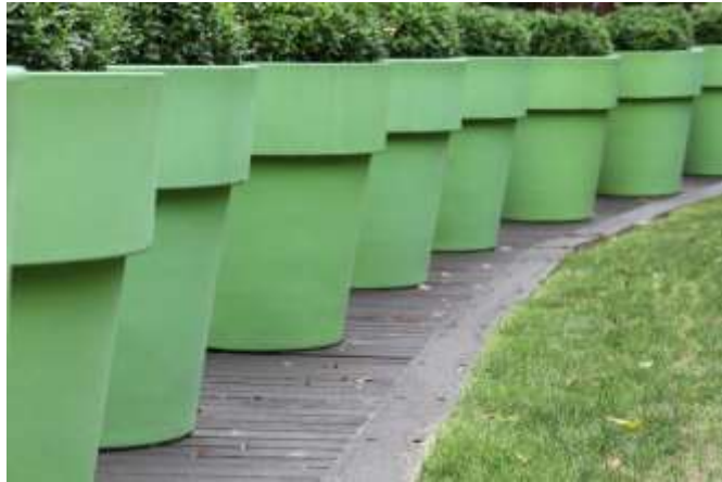
Curvature: Michelle Coles