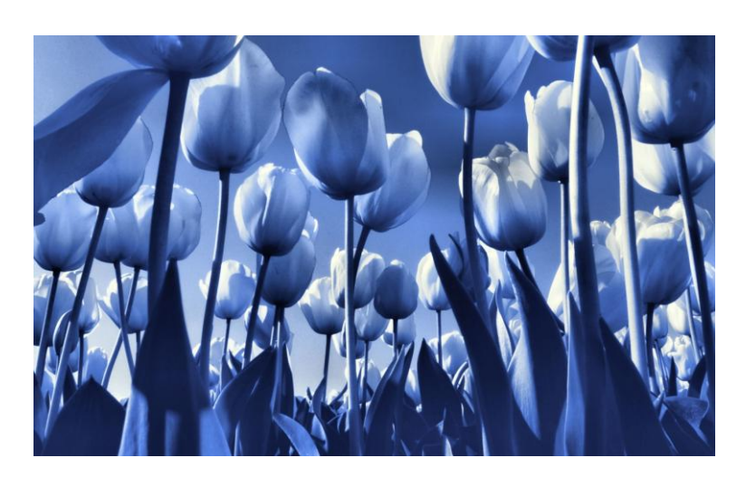
Hosted by Warren Veivers AFIAP FAPS SSAPS PSQA and Sue Gordon AFIAP AAPS PSQA

For an additional fee of $60, all materials including transparencies, chemicals, equipment and paper will be supplied as well as a take home booklet outlining each process. The workshop will run over two sessions on Saturday and Sunday of the PSQ Convention. Book early to reserve your place as the workshop is limited to ten people due to the available space.