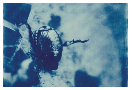
Note – this workshop is limited to ten participants